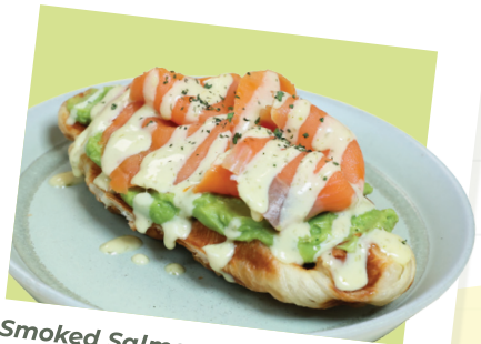
Smoked Salmon Croffle (1 PC)