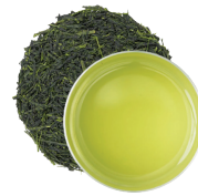
ゆたかみどり煎茶 Yutaka Midori Sencha 48 (Hot)