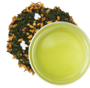
玄米茶 Genmaicha Roasted Rice 48 (Hot)