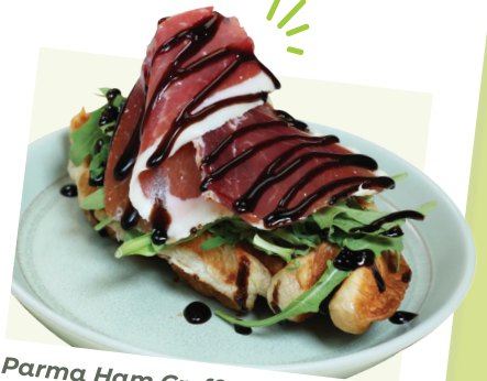
Parma Ham Croffle (1 PC)

Arugula Lettuce, Balsamic Vinegar 巴馬火腿, 火箭菜, 義大利黑醋