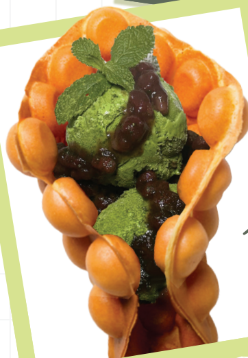
Matcha & Red Bean