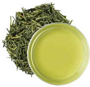
レモングラス緑茶|香茅緑茶 Lemongrass Green 48 (Hot)