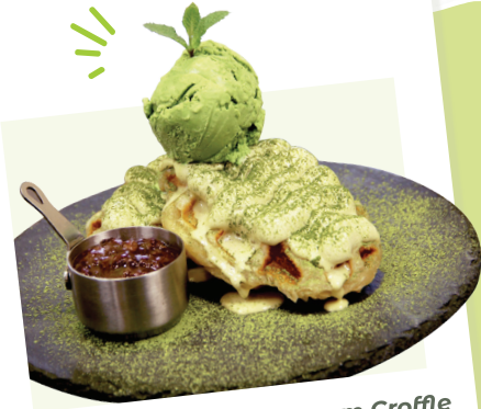
Red Bean & Matcha Cream Croffle