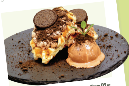
Oreo & Chocolate Cream Croffle