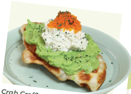
Crab Croffle (1 PC)