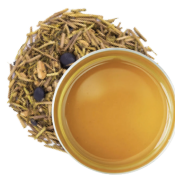
黒豆ほうじ茶|黒豆焙茶 Black Bean Hojicha 48 (Hot)