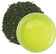
シグネチャー煎茶 Signature Sencha 48 (Hot)