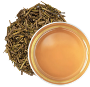
ほうじ棒茶|焙茶 Hojibo Roasted 48 (Hot)