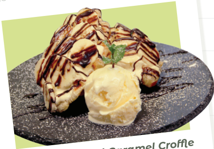
Banana & Salted Caramel Croffle