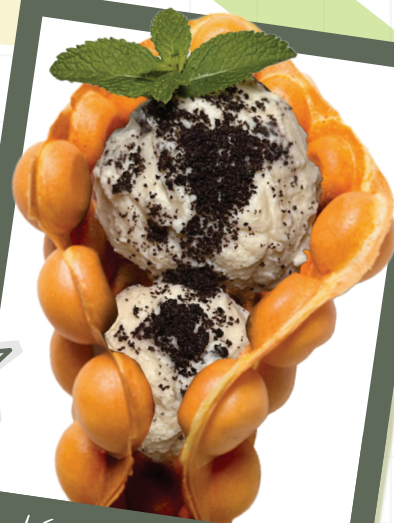
Vanilla Ice Cream & Oreo Crumbs